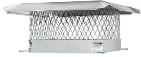
Stainless Steel Chimney Caps