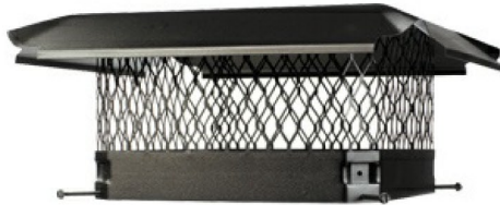
Black Galvanized Chimney Caps

Traditional Size Bolt-On Covers for Masonry Chimneys